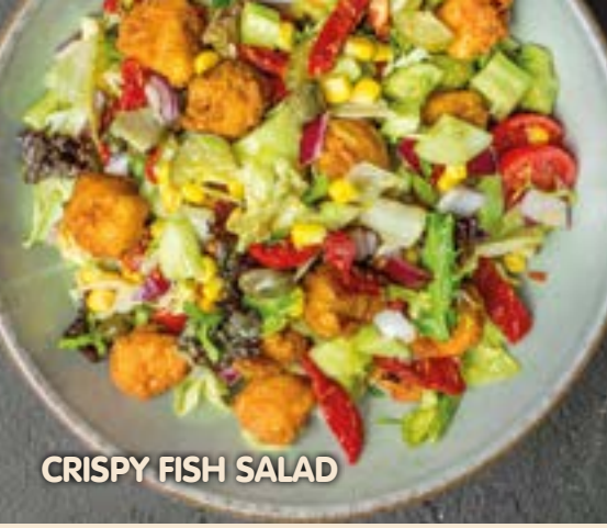
CRISPY FISH SALAD