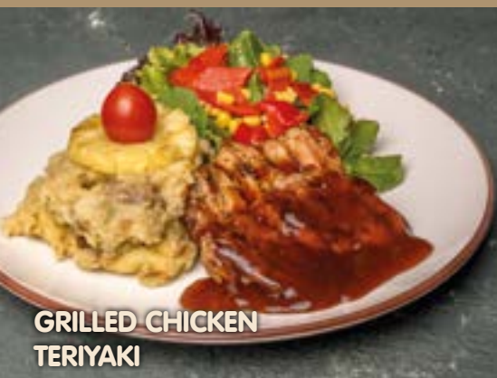
GRILLED CHICKEN TERIYAKI

Mediterranean greens, roasted red pepper, sautéed cubed potatoes