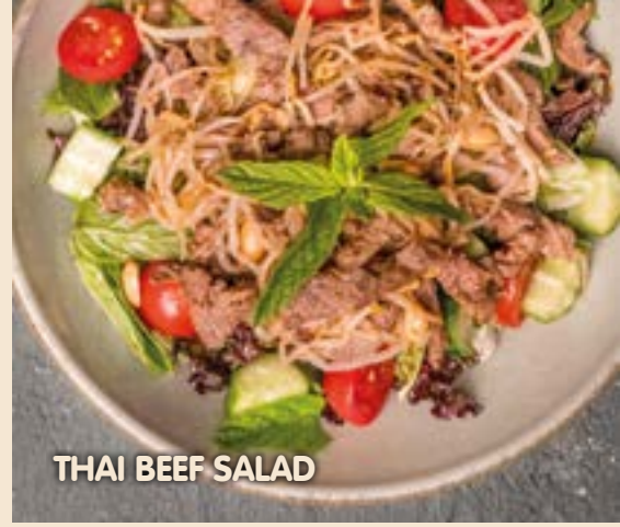
THAI BEEF SALAD