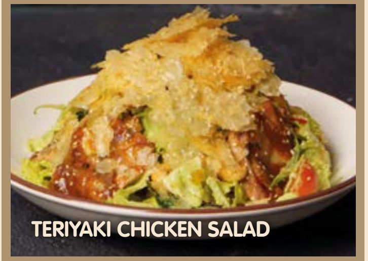
TERIYAKI CHICKEN SALAD