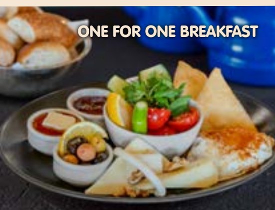
ONE FOR ONE BREAKFAST

Mozzarella cheese, "sucuk", salami, mushroom, sweet green pepper