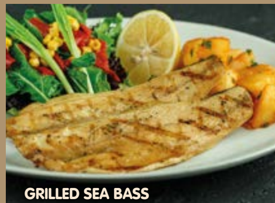
GRILLED SEA BASS