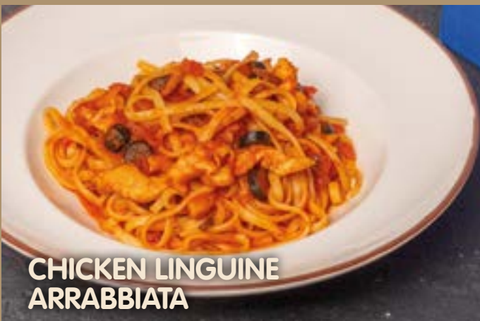
CHICKEN LINGUINE ARRABBIATA