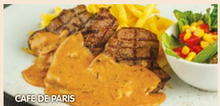
CAFÉ DE PARIS