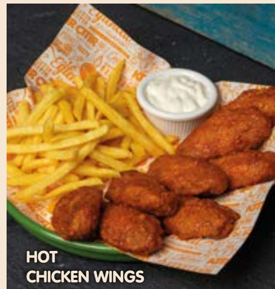
HOT CHICKEN WINGS