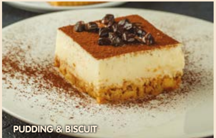
PUDDING & BISCUIT