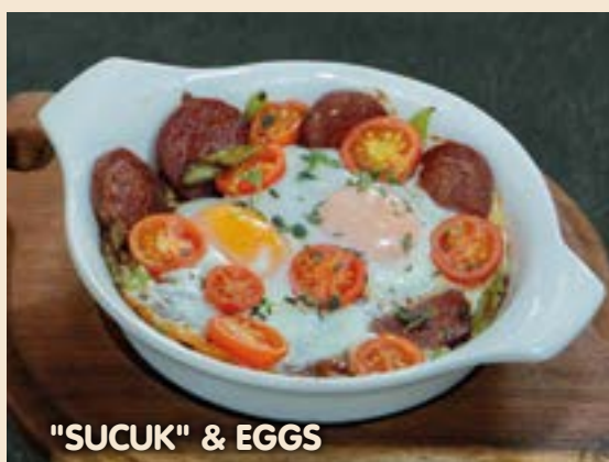
"SUCUK" & EGGS