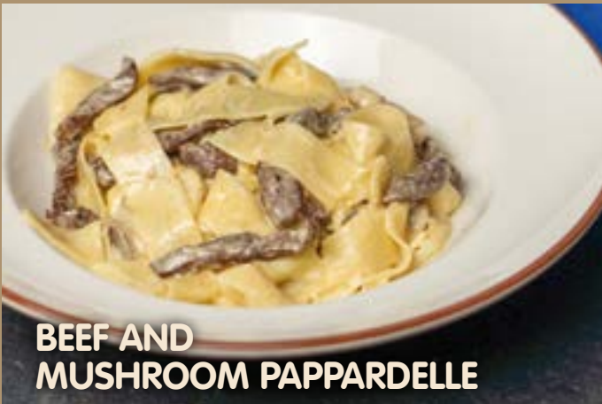
BEEF AND MUSHROOM PAPPARDELLE