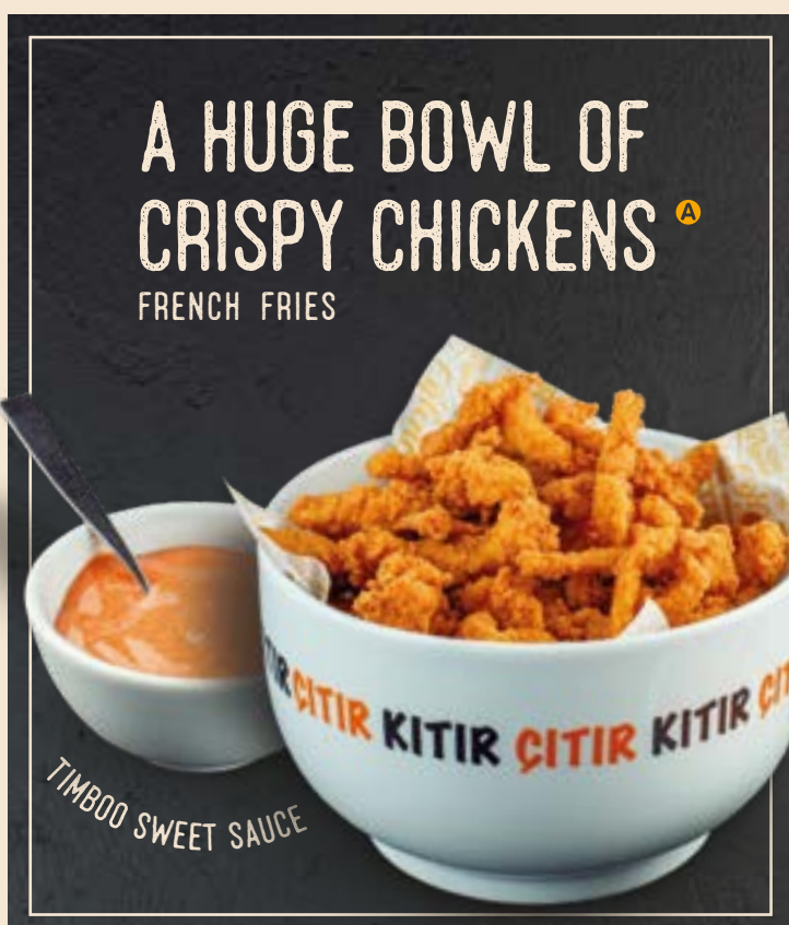
A HUGE BOWL OF CRISPY CHICKENS A