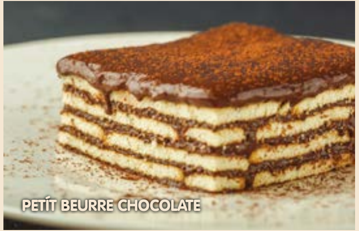
PETÎT BEURRE CHOCOLATE

Two scoops of vanilla and chocolate ice-cream, fresh fruits in a crispy cone