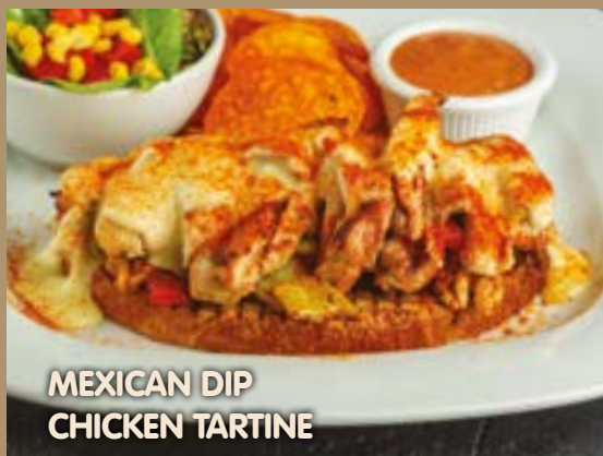
MEXICAN DIP CHICKEN TARTINE