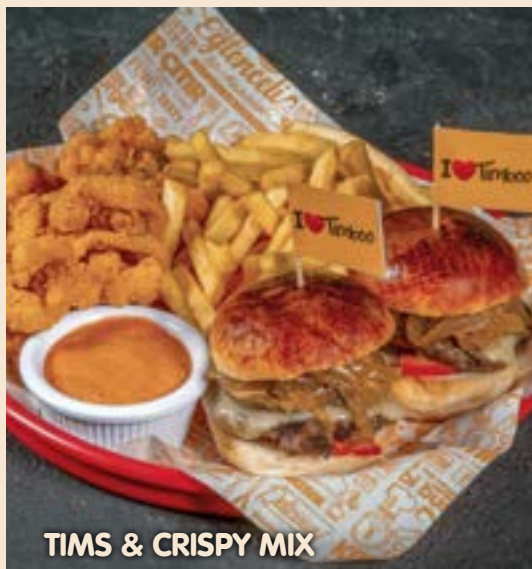
TIMBOO & CRISPY MIX